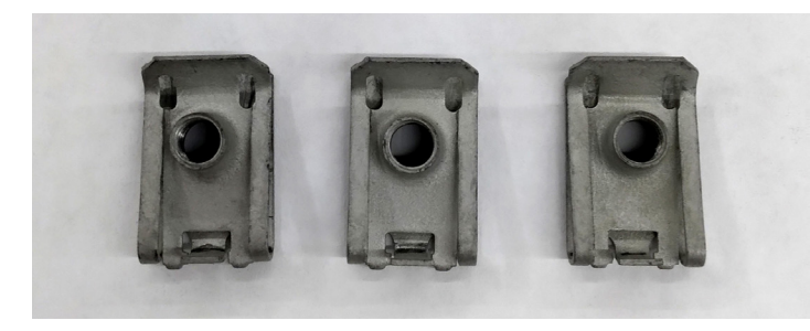
Picture 1 4. Slide one insert into the supplied clamp as illustrated in Picture 2.