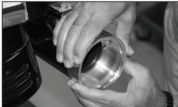
Picture 2: End cap installed with holes lined up with holes in baffle