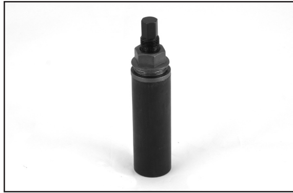
S&S® Inner Primary Bearing Race Installer Tool PN 56-5145

NOTE: Threads of the driver screw should be coated with a graphite lube to protect threads.