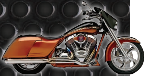
Pro-Tour 'X' by Dougz Custom Paint and Fabrication

49-State and 50-State Emissions Compliant & Performance Engines