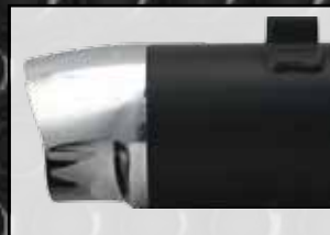
Chrome Billet End Cap