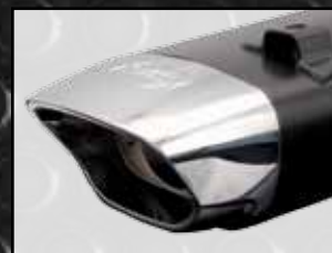
SPO® Chrome End Cap