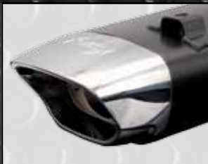
SPO® Chrome End Cap

For those who like to change things up, replacement end caps and heat shields are available.