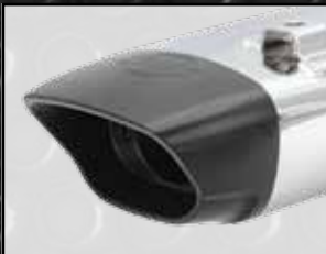
SPO® Black End Cap