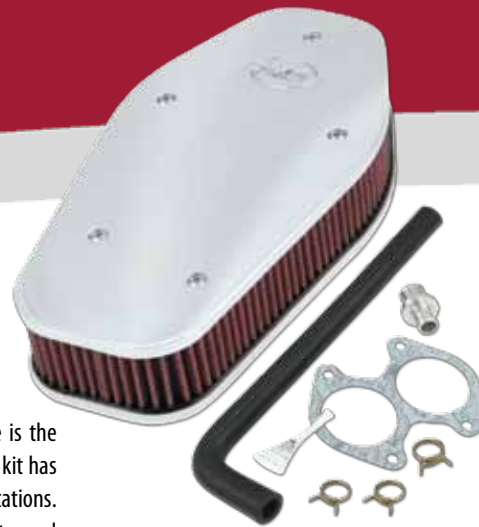
S&S air cleaner for 2008-up Freedom engines except Vision, Crossroads, Cross Country or Touring Cruiser models

One of the most economical and cost effective performance products available for the Victory Freedom® engine is the S&S® high performance air cleaner kit. Used in conjunction with a set of Victory Stage 1 performance mufflers, this kit has consistently shown an increase of up to 20 horsepower from a stock 100" Freedom engine, with no other modifications. S&S air cleaner kits are available for all 2003-up models with Freedom engines except Vision, Crossroads, Cross Country and Touring Cruiser. 50-state kit calibration ensures that the motorcycle complies with emission standards after kit is installed.