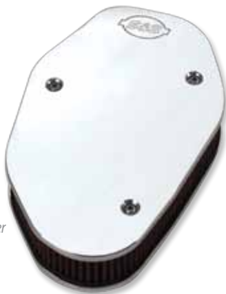
S&S air cleaner for 2003-'07 models, except Touring Cruiser