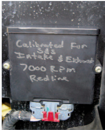
Here's the remapped S&S ECU; it's calibrated specifically for their intake and exhaust combo on an RZRS, with a 7000 rpm redline. S&S offers different calibrations and rev limits for custom applications as well.

BREATHE OUT: The stainless S&S exhaust comes in four pieces; a header, a midpipe, a muffler and a large billet aluminum endcap. Installation is easy; it even comes with a new head gasket, muffler gasket and hardware. If you're just installing the exhaust, it can be done in about 20 minutes. The muffler has a removable spark arrester screen that is accessible by pulling off the billet endcap with four Allen-head screws. The exhaust uses unique internal baffling to keep the RZR quiet while still increasing performance, and it works. It's in no way offensively loud. It measured a tame 97.4 dB on our ATV Action sound meter.