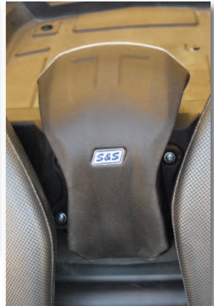
The front of the scoop is held on with four Phillips head screws, and unbolts to reveal the filter and airbox.

PERFORMANCE: S&S claims that the stock RZR's ECU mapping is rich enough to run their intake and exhaust, but to reach maximum power potential, a re-map of the stock ECU is necessary. They have the re-map service available for $399.95, because they cannot perform the service on a stock Polaris ECU. After you have purchased the S&S ECU, you can have it recalibrated (for motor mods and such later on) for $150. With the intake, exhaust and S&S ECU installed, our RZRS started right up with no drama. After letting it warm up, we took it for a couple laps to get a feel for the newfound power, and you can tell the difference. Using our private test strip, our bone-stock RZRS ran 0-40 mph in 4.53 seconds in 2WD, which beat out our standard RZR by 0.16 seconds. The S&S-equipped RZRS did the 0-40 sprint in just 4.02 seconds—shaving a half-second off its time. The power is