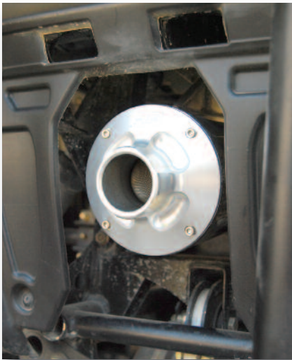
The billet aluminum endcap adds a bright touch, and the exhaust isn't too loud. The spark arrester comes out easily via the four Allen-head bolts.

easily. We completed the intake, exhaust and ECU install in a little over two hours.